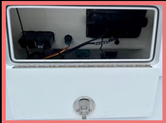
Front Console Access