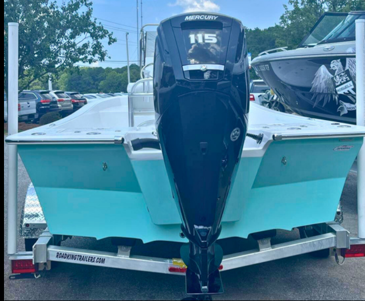
Mercury Outboard (Max HP:115)