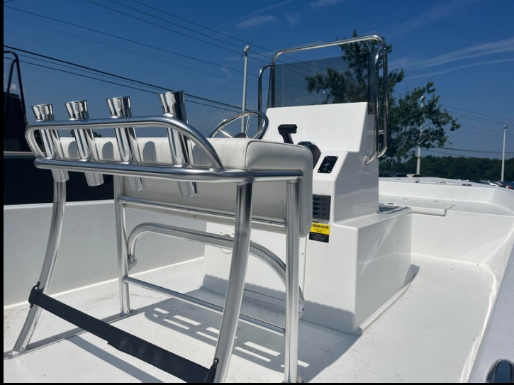
Deluxe Leaning Post