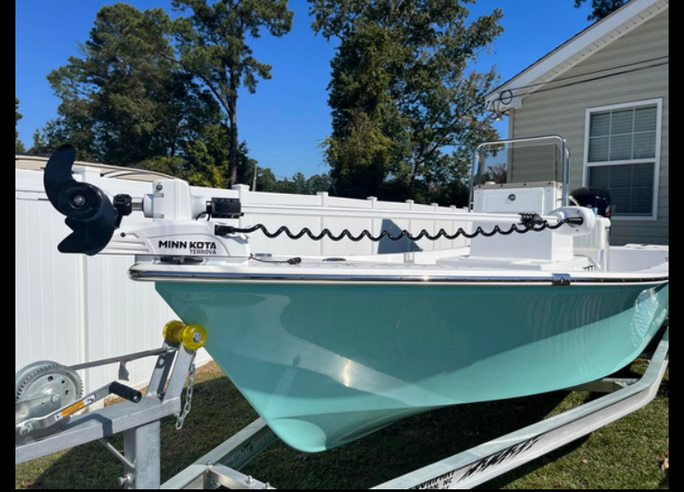
TONS of Accessories can be optioned

Optional Hull Colors: Ice Blue, Sky Blue, Fighting Lady Yellow, Seafoam, Kingston Grey, Desert Sand. (White is standard color)